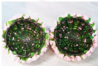
Step 1: Separate the two halves