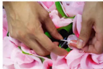
Step 3: Recommended reinforcement with zip ties