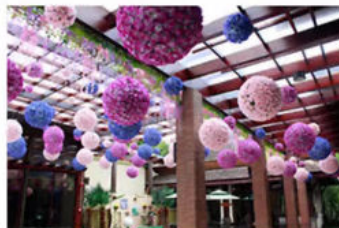
Step 4: Installation completed