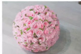
Step 2: Merge