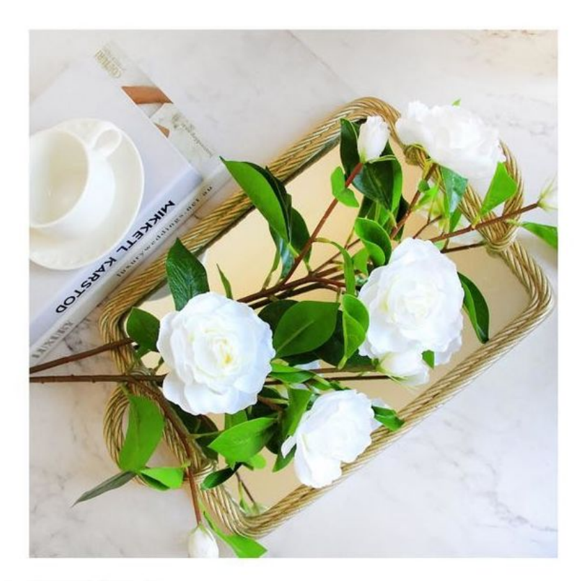
Beautiful home is warm person,