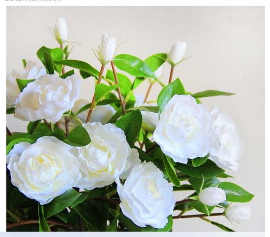
and warm you where is it